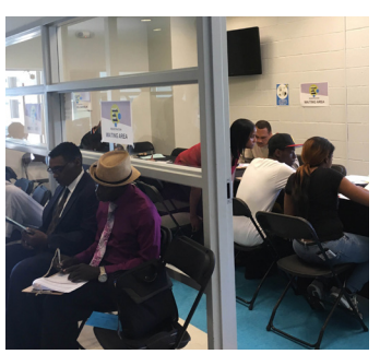
Applicants filling out paper work for DGS and Rec and Parks