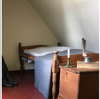
The wall after the damaged plaster had